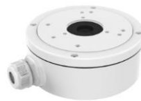
DS-1280ZJ-S Junction Box